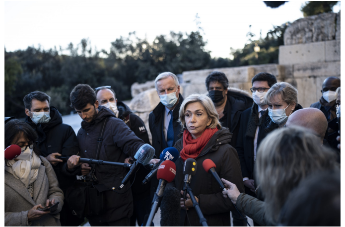
French Presidential Candidate Péresse's visit to Samos

Péresse's visit was also met by a protest organised by the Somali community. Many people from Somalia are currently arbitrarily detained as they are unable to present a valid asylum applicant card upon leaving the camp. The group displayed banners like "Stop Detention" and "Freedom, Justice, Equality for all". Their statements stand in stark contrast to the Péresse approved policy of humanity.