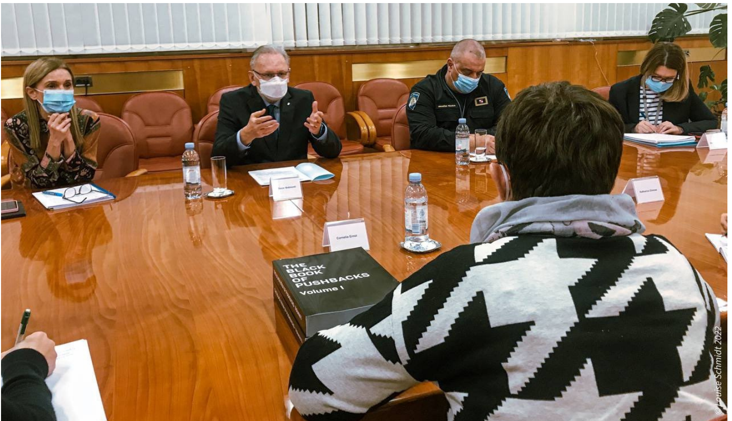
MEP Ernst meets with Croatian Minister of the Interior.

In Velika Kladuša, No Name Kitchen volunteers met with the delegation and discussed the persistence of pushbacks at the Croatian border, the lack of consideration of people-on-the-move's requests for asylum, and the abuses they endure at the hands of the police such as beatings and the stealing of personal items like phones, money or ID documents. The living conditions of people-on-the-move in Velika Kladuša and its surrounding area were addressed, along with the barriers to humanitarian work on the field due to the criminalization of the latter.