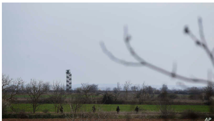
SECTION OF THE FENCE ALREADY CONSTRUCTED BY KASTANIES, GREECE

BVMN published reports covering the pushback of 237 people from Greece to Turkey last month. The trends in crossings shifted during June, with a growing number of people attempting passage across the Aegean sea from the coast around Izmir (TUR). This has been reflected in the evidence gathered of pushbacks from respondents stranded on the Turkish side and their testimonies of the violence while on Greek land and especially territorial waters. Part of the reason for this changing of routes may be connected to the efforts by Athens to shore up existing fortification at the Evros land border, with more fencing