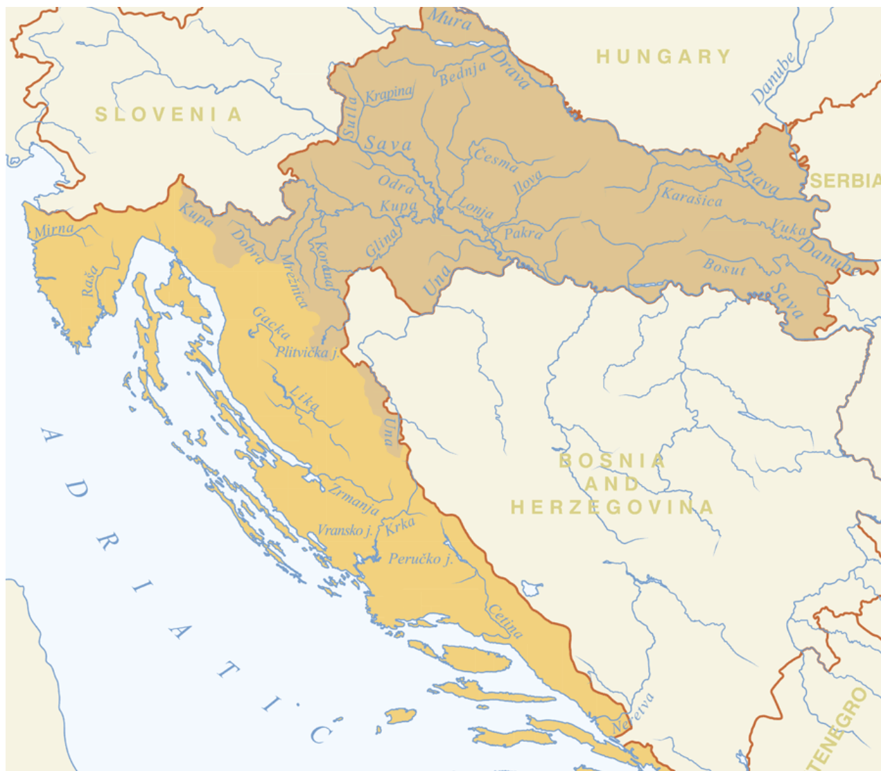
RIVERS IN CROATIA.

The Mrežnice and Korona are located in mid Croatia, marking the halfway point for those travelling from BiH to Slovenia. People taken fatally by their courses in June are a telling example of the reflexive way migration policy has weaponised the whole breadth of national interiors, bringing the border into the operation of everyday life. This borderisation of interiors can be seen across the experience of transit communities. It is overt in the way that police stations all over Croatia falsify records in order to pushback transit groups as if they had never entered the territory. Likewise, one can also observe it in the way linguistic borders are constructed by the abuse of translation services in custody, or the way racial profiling guides the apprehension of people in towns and cities.