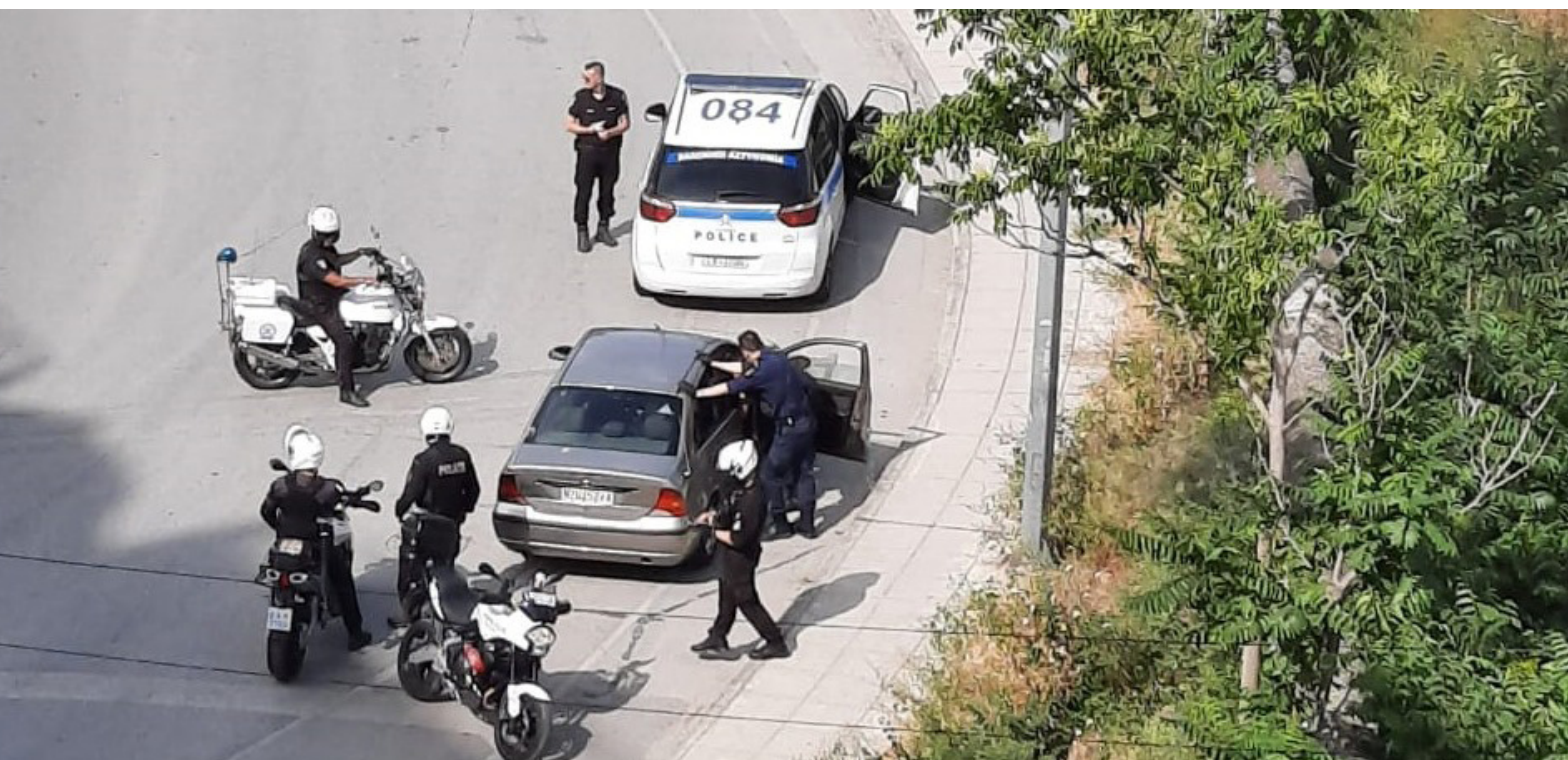
POLICE ON THE SCENE IN THESSALONIKI, BLOCKING ROADS DURING THE PUSHBACK

The climate in Greece, never warm for NGOs, has turned positively icy over the last month. In a bid to make the state a less attractive destination for people-on-the-move, the government has clamped down on groups working in camps, requiring them to register on a central database controlled by the Ministry of Migration. Whilst this has been touted as a move for greater transparency and coordination, the reality is starkly different. Refugee Support Aegean and Terres des Hommes Hellas have criticised the requirements for stigmatising solidarity work and creating “exorbitant costs” for government approved audits. The Expert Council on NGO Law also found the new legislation would require substantial revision to be in line with European standards.