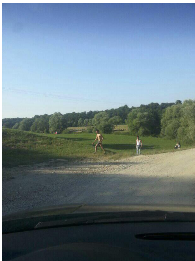
PEOPLE STRIPPED BY THE CROATIAN POLICE - NEAR TRZAC, BIH

of thousands of people removed illegally from neighbouring Croatia, a process occurring night and day at the direction of the Croatian Ministry of Interior (MUP). Network member No Name Kitchen works with people in this area and heard from some of those whose homes face out onto the Croatian border. Most recently in the Trzac area, locals have reported a high volume of incidents where groups approached them for clothes, having been stripped down to their underwear by Croatian police: