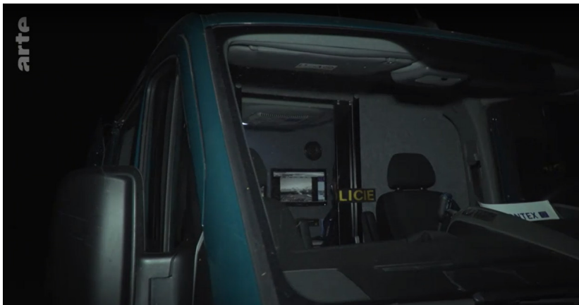
SURVEILLANCE VAN USED FOR SPOTTING TRANSIT GROUPS AT NIGHT FROM OUTSIDE & INSIDE

ment to detect them. Procedures relating to the use of force also appear to have been ramped up with interviewees (see 5.1 ) maintaining they were threatened with firearms, a development in line with new regulation allowing Frontex personnel to bear arms . Firearms, response vehicles and surveillance