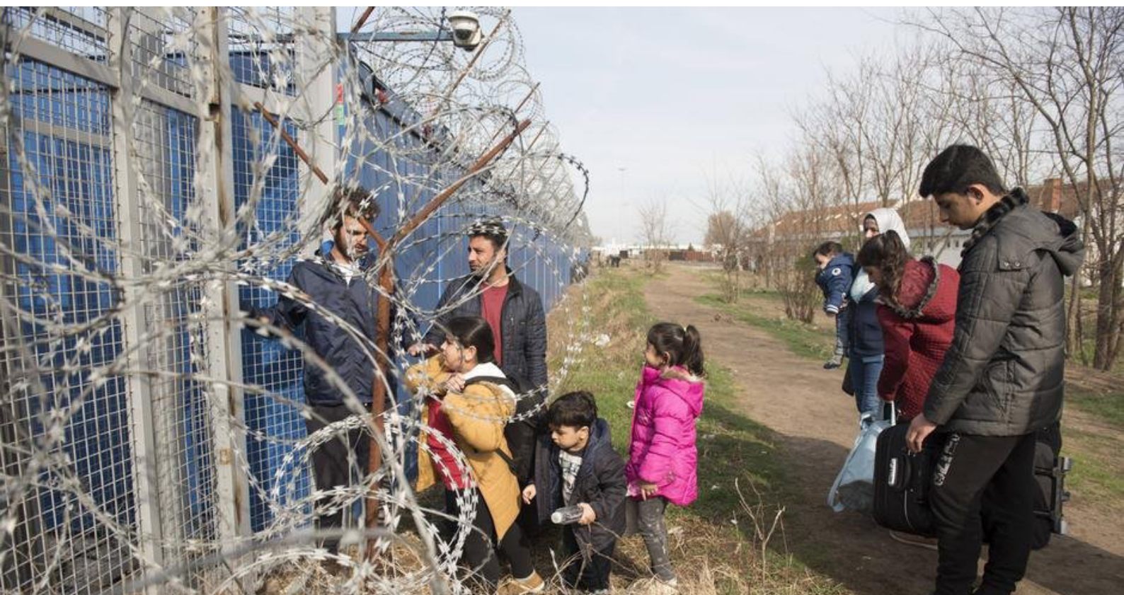
A FAMILY WAITING TO ENTER A TRANSIT ZONE IN HUNGARY

UNHCR slammed the Hungarian government in a recent report on Hungary's decision to require asylum applications to be filed in neighboring countries' embassies. The UNHCR report argues that the new law is in violation of "Hungary's obligations under international refugee and human rights law" as well as EU law. Because the law requires asylum seekers to file their application extraterritorially, it also violates the Geneva Convention which prohibits punishing asylum