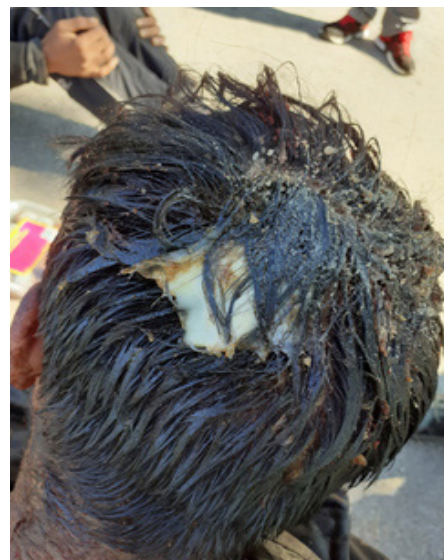
FOOD SMOTHERED INTO WOUNDS ON A MANS HEAD

weapon used to emphasise the risk of crossing state borders. While knives are latent in most cases, the knowledge of their prior use - alongside other tools like guns and tasers - forms part of the imaginary of those facing contact with law enforcement in Croatia. Parallel to the recent knife attacks Amnesty and BVMN also spoke to a group affected by an incident where police used rifle butts to strike their heads till they bled (see 4.3 ). Officers compounded the attack by rubbing ketchup and mayonnaise into the wounds, serving to denigrate the injured bodies. These reports contribute to the growing understanding of pushbacks as acts of state sanctioned torture, a lens through which BVMN has analysed Croatian border practice before, both around the use of firearms and a myriad of other practices .