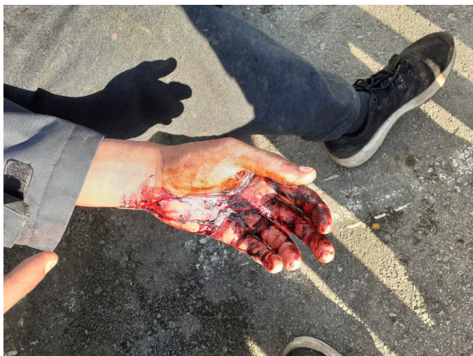
PUSHBACK INJURIES CAUSED DURING THE EMBEZZLEMENT OF THESE FUNDS

In correspondence with a LIBE member in April, regarding the lack of a border monitoring mechanism and the subsequent cover-up, commissioner Ylva Johansson confirmed the Commission received a final technical implementation report from the Croatian authorities on 28th February. According to the letter obtained by the BVMN, Croatian authorities were "promptly requested to submit additional information" to assess whether