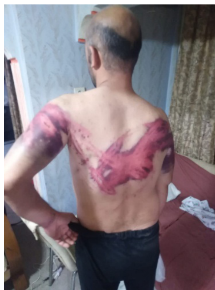
BRUISING INCURRED FROM BATON STRIKES

and the increased militarisation of the area. Network member Josoor is observing first hand the fallout of these removals and the protracted struggle of those now recovering in Turkey. People who braved the land border in recent weeks were met with a wall of abhorrent violence on the part of Greek officials. Several respondents reported to volunteers the use of electric discharge weapons and attacks with batons. Meanwhile, one transit group shares how they were thrown into the Evros river with their hands cuffed with zip ties (see 6.6 ) - a potentially fatal tactic which has been observed in a previous case . While