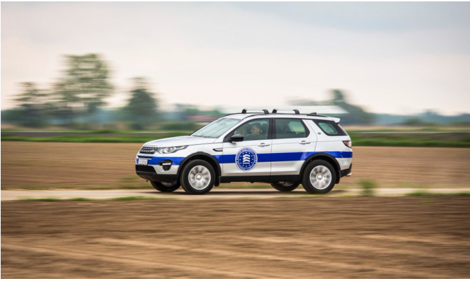
FRONTEX VEHICLE USED IN ALBANIAN MISSION

“NEXT TIME IF YOU RUN WE CAN SHOOT ON YOU, IF WE SAID ‘STOP’, YOU STOP”