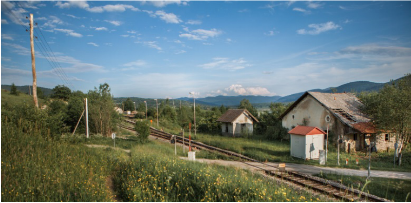
SITE OF ONE KNIFE ATTACK - BLATA, CROATIA

“HE KNIFED THE INDEX FINGER OF MY LEFT HAND, AND BLOOD STARTED SPURTING OUT LIKE A SMALL SHOWER, THEN HE SMILED, THEN HE CUT MY MIDDLE FINGER FOLLOWED BY MY PALM WITH A LARGER CUT.”