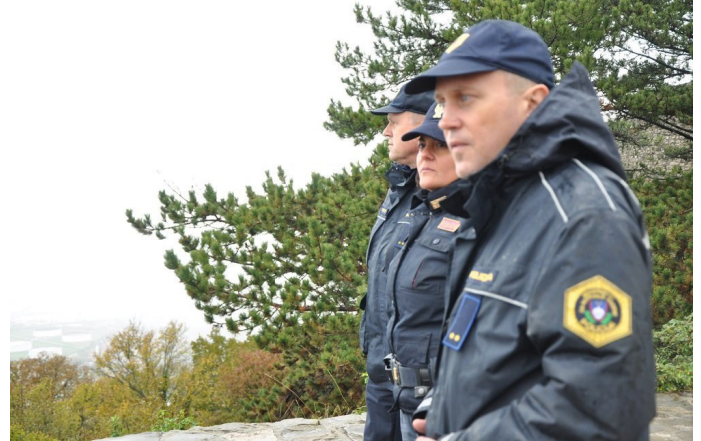
JOINT PATROL OF SLOVENIAN AND ITALIAN POLICE

The Italian state , counters criticism of these removals, claiming they remain legal while the “readmitted migrant is not deprived of the possibility of applying for asylum, as Slovenia is part of the European context”, something Italian legal experts contest. These hurried procedures spiked in May when as many as 30 people appear to have been returned to Slovenia in just a single day.