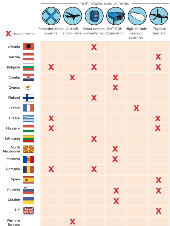
Ways to control borders